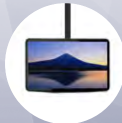
CEILING TV MOUNT 32"-60"