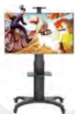
LIGHT TV STAND 40"-60"

ELEGANT AND STYLISH, DESIGNED AS A SOLUTION TO CREATE MOBILITY FOR YOUR ENTERTAINMENT NEEDS