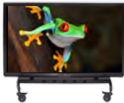
MOBILE COLUMN LIFT