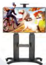
MEDIUM TV STAND 50"-70"