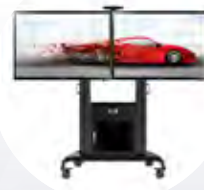
LARGE WORKSTATION 2 X 50"-60"