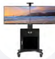
MEDIUM WORKSTATION 2 X 42"-52"