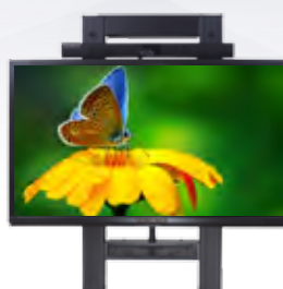
WALL MOUNT FIXED AND HEIGHT ADJUSTABLE