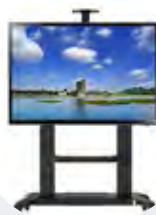
HEAVY TV STAND 60"-100"