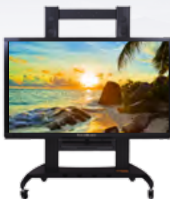
MOBILE FIXED AND HEIGHT ADJUSTABLE