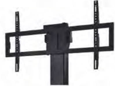
Extension Brackets to support VESA to 1470 x 870mm