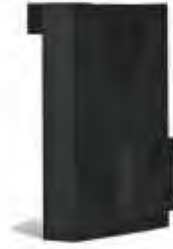
Keyboard Mouse Bracket