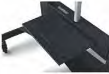
Front Laptop Tray