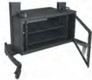
Lockable AV Cabinet