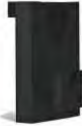
Keyboard Mouse Bracket