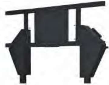
Extension Brackets to support VESA to 1000 x 600mm