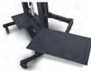
Side Laptop Tray