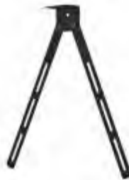
Web Cam Bracket