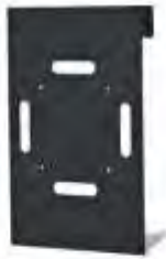
Mini PC Bracket