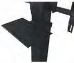
Rear Laptop Tray