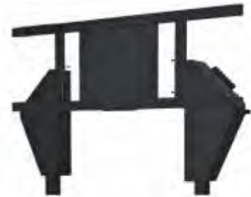
Extension Brackets to support VESA to 1000 x 600mm