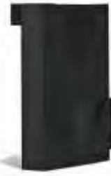
Keyboard Mouse Bracket