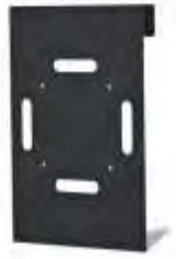
Mini PC Bracket