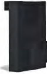
Keyboard Mouse Bracket